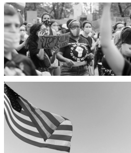
The Search, 2020 (video stills)