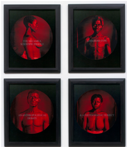
You Became a Scientific Profile, A Negroid Type, An Anthropological Debate, & A Photographic Subject , from the series From Here I Saw What Happened and I Cried , 1995 – 96