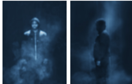
All the Boys (Profile 1) , 2016