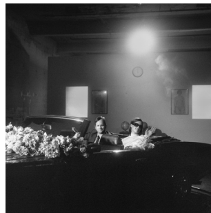
The First Major Blow , from the series Constructing History , 2008