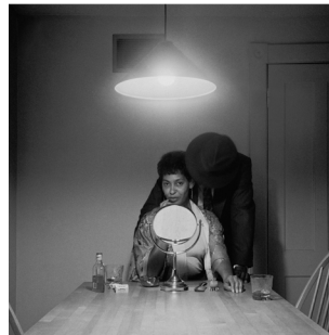
Untitled (Man and Mirror) from the series Kitchen Table Series, 1990