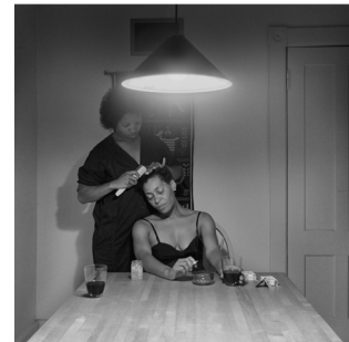
Untitled (Woman Brushing Hair) from the series Kitchen Table Series, 1990