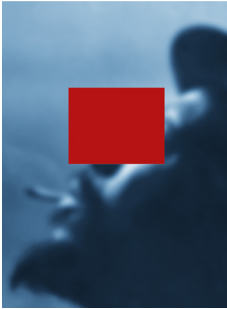
Blue Notes (Monk), 2014