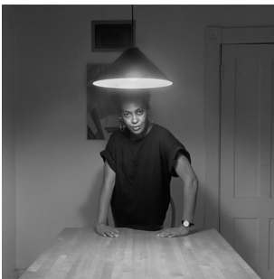
Untitled (Woman Standing Alone) from the series Kitchen Table Series, 1990