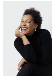
Portrait Carrie Mae Weems