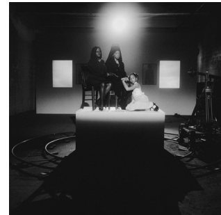
Mourning , from the series Constructing History , 2008