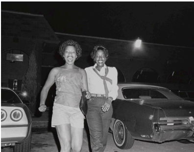
Welcome Home, from the series Family Pictures and Stories, 1978-84