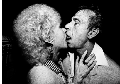
From Back Home/Värmland, 2009