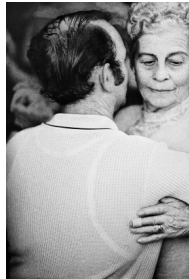
Stockholm, Gröna Lund, 1973