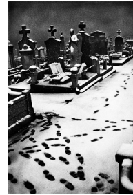
Saint Étienne, 2005