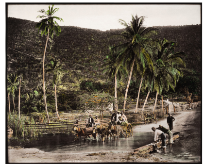
The Valentine Days (2017) © Ingrid Pollard