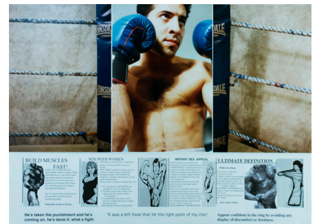
Contenders (1995)