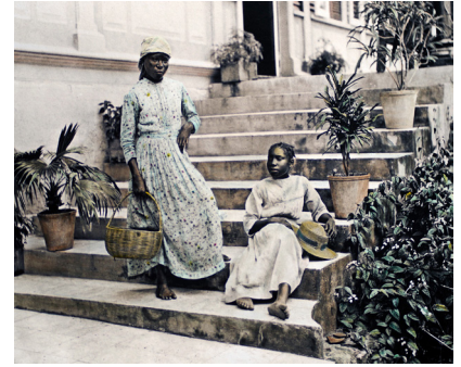
Valentine Days (2017)