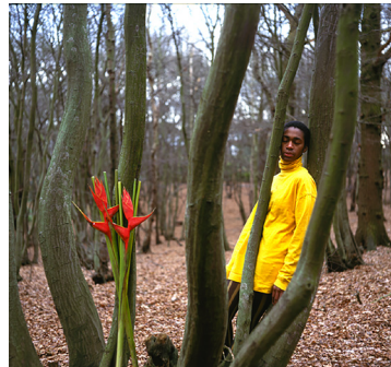
Self Evident (1992) © Ingrid Pollard