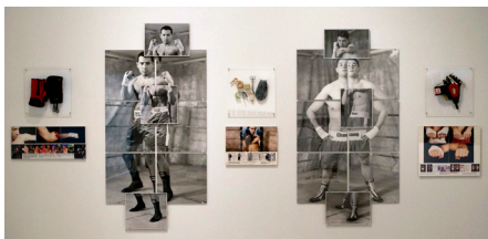
Contenders (1995) © Ingrid Pollard