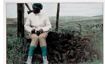
"pastoral interlude" it's as if the Black experience is only lived within an urban environment. I thought I liked the Lako District; where I wandered lonely as a Black face in a sea of white. A visit to the countryside is always accompanied by a feeling of unease; dread