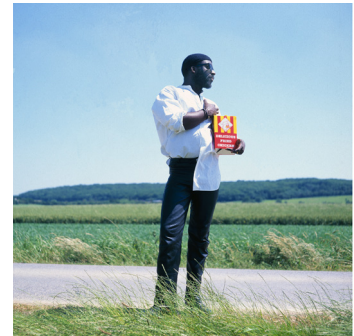
Self Evident (1992) © Ingrid Pollard