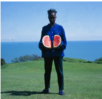
Self Evident (1995)