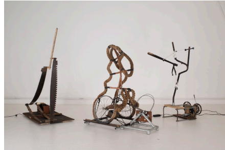
Bow Down and Very Low – 123 (2021)