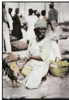
The Valentine Days (2017) © Ingrid Pollard