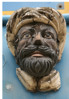
Seventeen of Sixty Eight (2019) © Ingrid Pollard